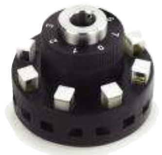
Eight-position cell holder

Multiple kinetics measurements can also be run in parallel by automatically staggering the time of measurement for each sample fitted in the cuvette changer.