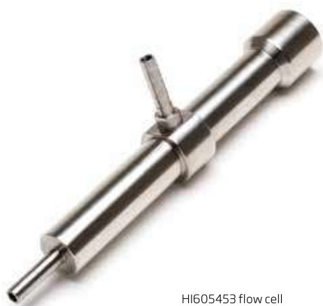
HI605453 flow cell for ultrapure water

High purity water used in power generation, semiconductor manufacturing, and other industries can be difficult to measure due to the ability of carbon dioxide ( \text{CO}_2 ) to diffuse into water and form carbonic acid ( \text{H}_2\text{CO}_3 ). Carbonic acid quickly dissociates into hydrogen ions ( \text{H}^+ ) and bicarbonate ions ( \text{HCO}_3^- ). These ions will increase the conductivity and decrease the resistivity of the water. In order to measure high purity water accurately it is necessary to perform a continuous flow measurement. HI98197 uses the HI763123 platinum, four-ring probe with a threaded connection that is screwed into a stainless steel body flow cell. The flow cell is then connected to a water source to more accurately determine the conductivity or resistivity without exposure to air. HI98197 is an ideal meter for monitoring the efficiency of a mixed bed resin or equivalent system that produces high purity water of 18.2 \text{ M}\Omega \cdot \text{cm} at 25^\circ\text{C} .