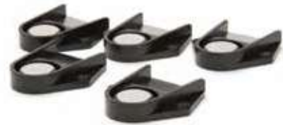
HI920005 Tag holders with tags (5)

Install tags near your sampling points for quick and easy iButton® readings. Each tag contains a computer chip with a unique identification code encased in stainless steel. You can install a practically unlimited amount of tags.